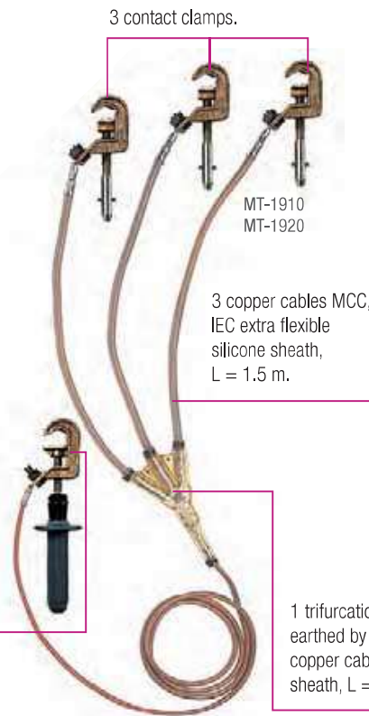
3 contact clamps.