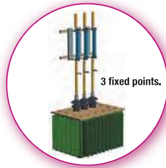
3 fixed points.